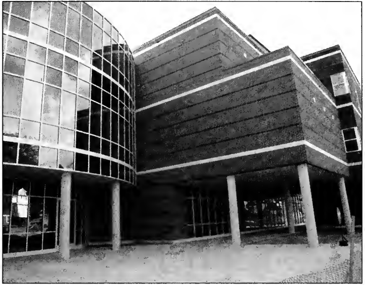
New $19.4-million Science Building

Campus: The 70-acre main campus on Walton Way is undergoing an ambitious building program, which is virtually changing the face of the university. A new $19.4-million Science Building has been constructed, and construction is underway behind Bellevue Hall on the first of two